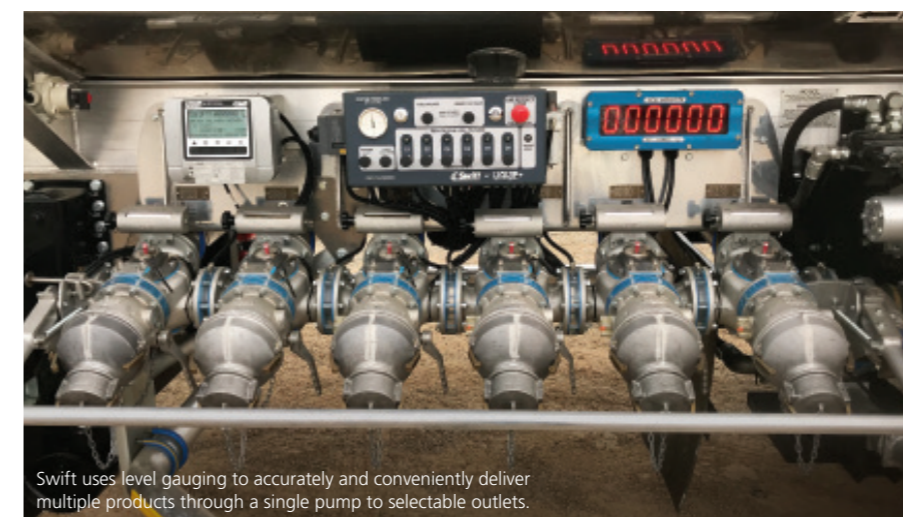
Swift uses level gauging to accurately and conveniently deliver multiple products through a single pump to selectable outlets.

South West Fuel has a long association with Liquip Wagga and Holmwood Highgate tankers. It's newest six-compartment tanker features the market leading Liquip Swift delivery system and is fitted with Liquip's double drop tested VOH451 series hatches.