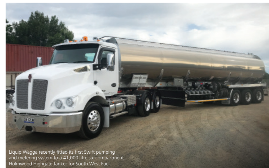
Liquip Wagga recently fitted its first Swift pumping and metering system to a 41,000 litre six-compartment Holmwood Highgate tanker for South West Fuel.